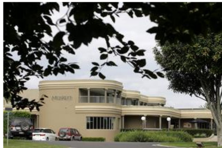
Mills Reef Winery.

The vineyard's 2007 vintage of Syrah and Cabernet Sauvignon have amassed six 5-star awards, three gold medals, and a coveted Trophy.